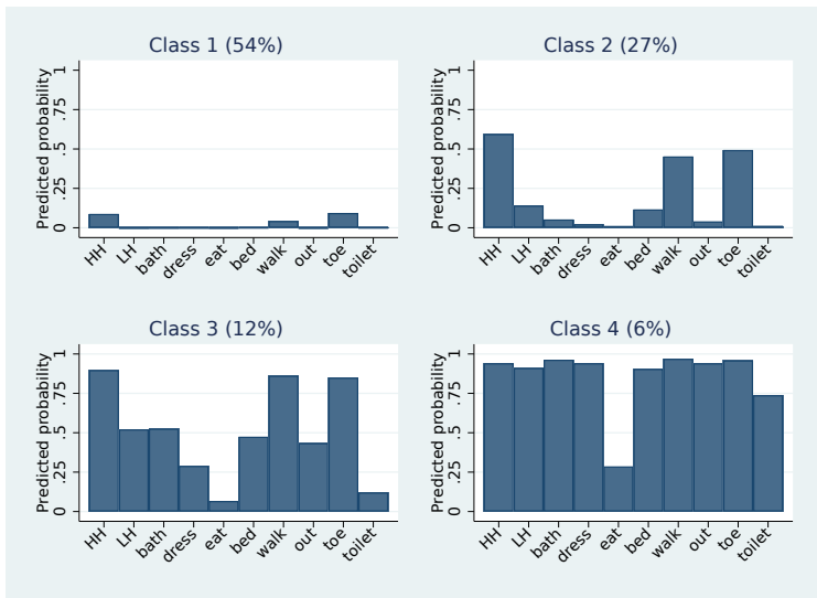
Figure from Flaherty, B. P. & Shono, Y. (2021), Many Classes, Restricted Measurement (MACREM) Models for Improved Measurement of Activities of Daily Living, Journal of Survey Statistics and Methodology , 9(2), 231–256. doi:10.1093/jssam/smaa047.